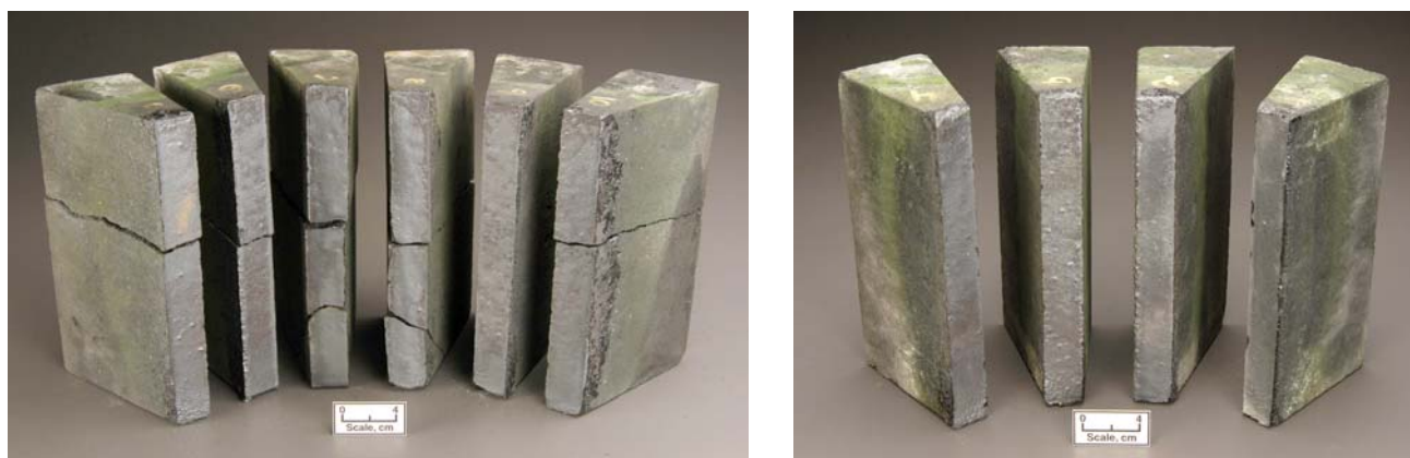
Figure 1. Refractory brick following exposure in the rotary kiln test. To the left are commercially-produced high chromia refractories; to the right are the ARC-ANH developed refractories.

While not currently an issue, there is some concern that the future use and disposal of chrome-bearing materials will be subject to more-stringent environmental regulations. The Albany Research Center is also looking to this future by beginning the development of a non-chrome based refractory material that will have the requisite stability for long service life in a