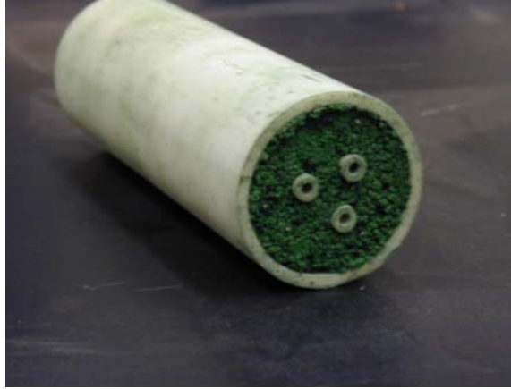
Figure 3. ARC-engineered thermocouple protection system for gasifier systems.

thermocouple assembly will be tested in the laboratory to confirm its relative resistance to slag penetration and attack. After the laboratory exposure tests are completed, fully instrumented prototypes will be produced in collaboration with our partner thermocouple manufacturers, for testing in commercial gasifiers.